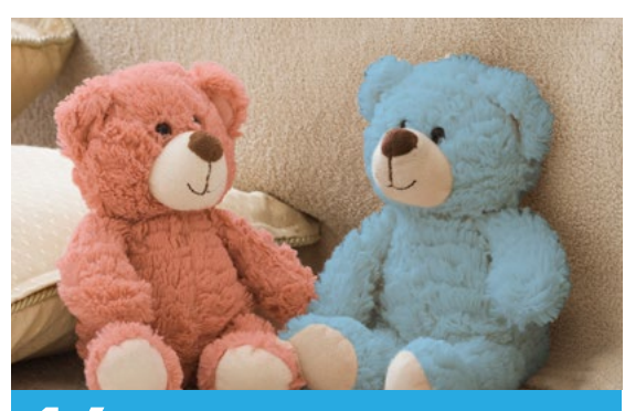
Sleep Issues & Care Partners